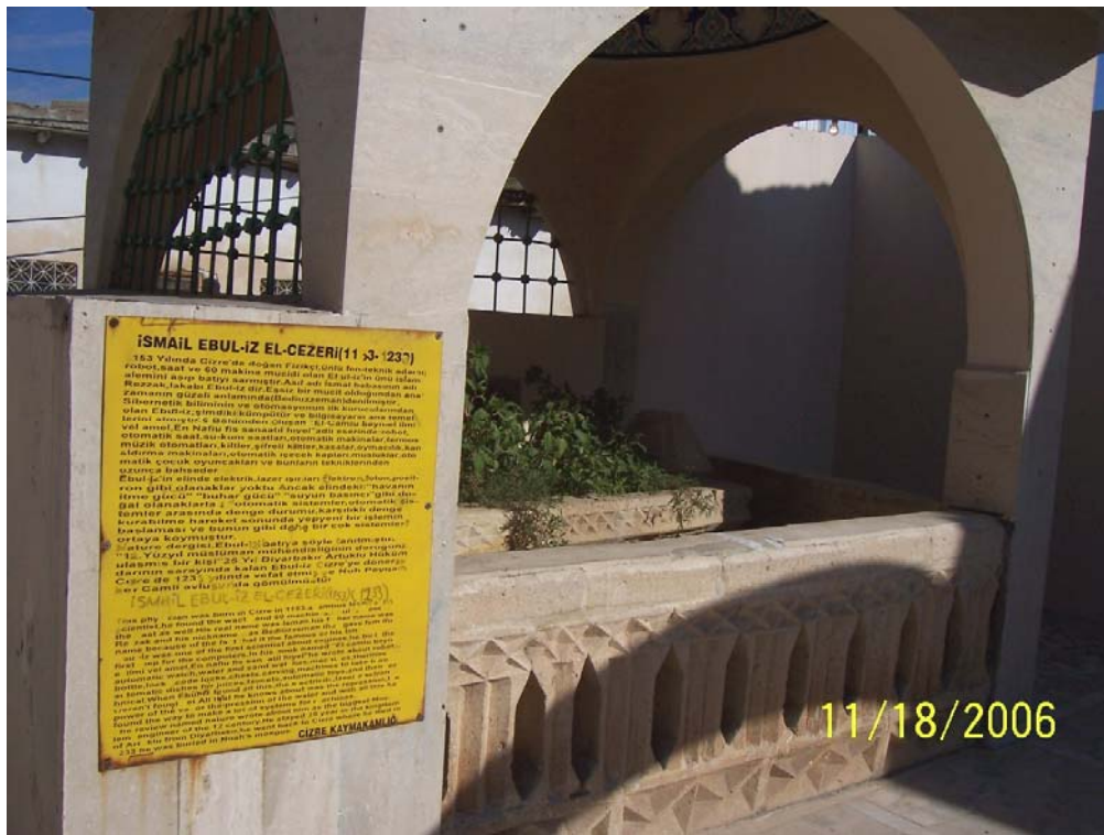
Figure 2: Tomb of Al Jazari