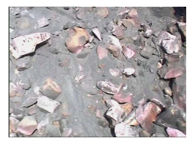
Figure 3. Waste casting sand