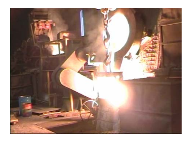
Figure 1. Melting in induction furnace

Maximum foundry productivity is 1100 tons gray iron melt per month, if work is organized in three shifts. Casting line is designed by Italian company ADRIABATIC, and is totally automatic. Hand foundry for bronze products has a maximum capacity of 3 tons per month and 12 tons for other nonferrous metals.