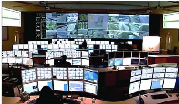
Figure 1. Traffic management and control center

Intelligent Transport Systems (ITS) is a very complex type of digitalization that is characteristic for transport business. This system contains several services related to transport and traffic management. ITS uses modern ICT technologies that provide a lot of information about the state of traffic on the roads, such as: weather conditions; traffic density; online cameras; notifications about accidents, stoppages and route changes. [3]