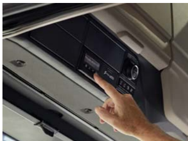
Figure 4 The Smart tachograph v2

The many advantages brought by usage of the smart tachograph v2 are enough reason that heavy vehicles for the transport of people and freight to be equipped with this device even before the prescribed deadlines for its mandatory use.